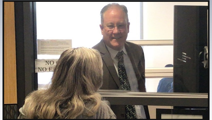
Ensen shares a smile with a taxpayer at the High Desert Government Center.