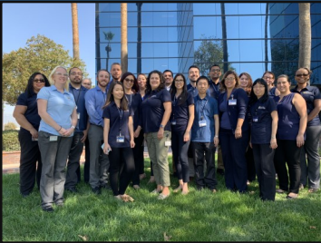
Controller Division Team gathers for a Pre-COVID picture in front of the ATC building.

The Popular Annual Financial Reporting Awards Program was established in 1991 by GFOA. This is the 14 th consecutive year that ATC has received this program's award, recognizing ATC's efforts to develop a high-quality popular annual report that is designed to be readily accessible and easily understandable to the general public.