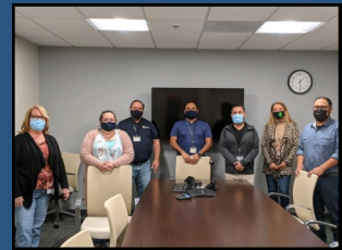
Central Collections strike force employees assisting with looming deadline for the Business Partnership Program.